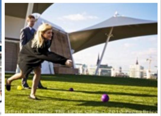
PICTURES USED IN THIS NEWSLETTER IS TAKEN DURING THE PRE-INAUGURAL CRUISE ( HAMBURG 16-18 APRIL 2010)