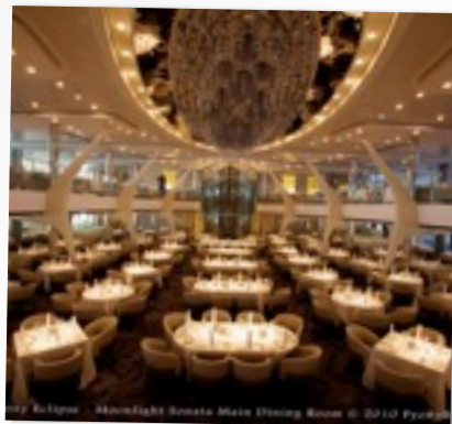
MOONLIGHT SONATA RESTAURANT