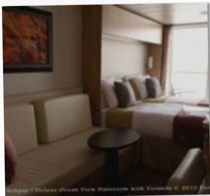
DELUXE VERANDA STATEROOM

have to give up on-land good time. There are many public sitting area, even around the cabin area to reduce the feeling of being “squeeze” by the metal wall, of course the best of all is The Lawn, a space design for those who would like to spend sometimes to either enjoy a “mini” cricket game, or just to do a real picnic on a real grass.